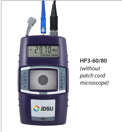
HP3-60/80 (without patch cord microscope)