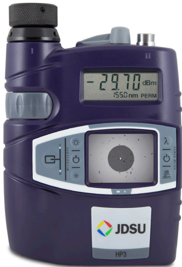
HP3-**-P4 Fiber Inspect and Test System with Integrated Power Meter and Patch Cord Microscope